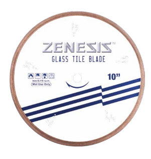
ZENESIS™ GLASS TILE