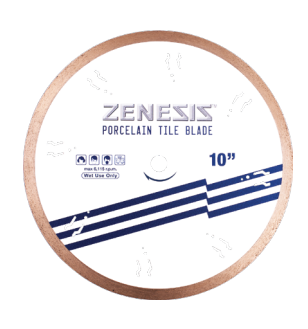
ZENESIS™ PORCELAIN TILE