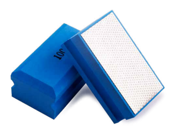
DIAMOND HAND PADS